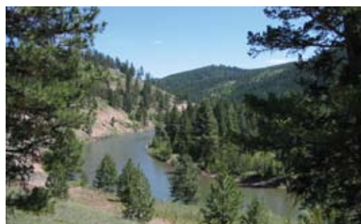
Blackfoot River, Montana