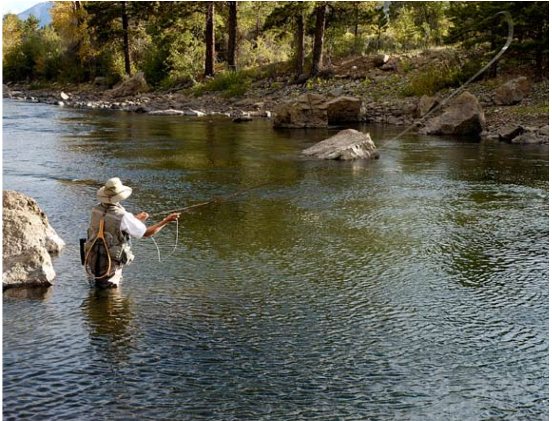
Fly fishing on the Arkansas River in Colorado.

For more information, please contact: Theo Spencer at NRDC (212) 727-2700