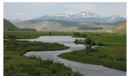
Big Hole River, Montana