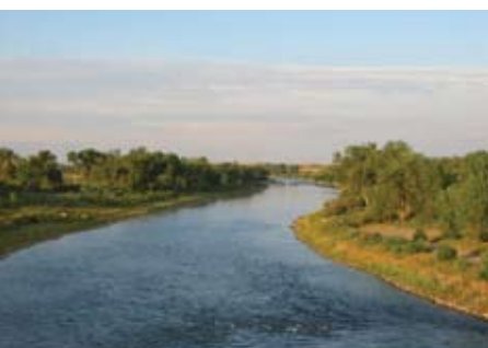
Big Horn River, Montana

Global warming is already changing the climate and affecting trout populations throughout the West. Through a combination of diminished snowpacks feeding cool water to rivers and streams, higher temperatures of the air and water, more frequent and larger wildfires , and the proliferation of disease that can accompany these changes, global warming will transform trout habitat. In some locations where the trout populations are particularly vulnerable, suitable habitat for trout could decline by 70 percent or more over the next 50 to 100 years. 4