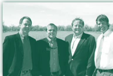
Attorney General Steve Bullock, Senator Kendall Van Dyk, Governor Brian Schweitzer and Mark Aagenes celebrate passage of the bridge access bill.

MTU efforts result in legislation affirming the rights of recreationists to use county bridge right of ways to enter rivers.