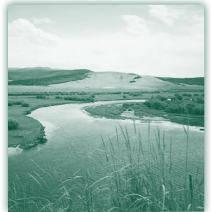
Big Hole River