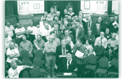
Stream access hearing in Helena